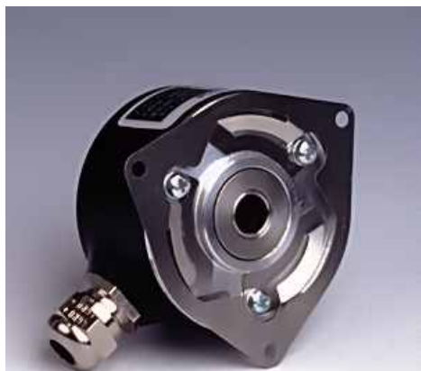
Hollow through Shaft